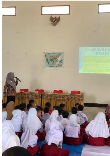
figure 3. speaker 2 delivered material on bullying prevention efforts in schools

Bullying is an act of deliberate and repeated attacks on the same person using power and strength to hurt someone who is considered disliked, by doing various things, and the perpetrator feels satisfied when he has done this emotionally both physically and verbally. (Maria, 2023). Bullying is a widespread social phenomenon involving individuals and groups. Bullying behavior is a bad act committed by a person or group with the aim of hurting others physically or mentally.