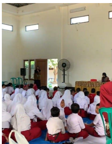
Figure 2. speaker 1 delivered material on bullying prevention efforts in schools

The community service aims to socialize how effective efforts are to prevent bullying in the school environment. This socialization was conducted in two sessions: the first was a presentation presenting the material, and the second was a question and answer session, where students were given their messages and experiences. In the initial session, the material was presented about the definition of bullying, its effects, and examples, as well as methods to avoid harassment so that students can know what bullying is and understand the impact of bullying. Besides that, students can also know how to overcome bullying.