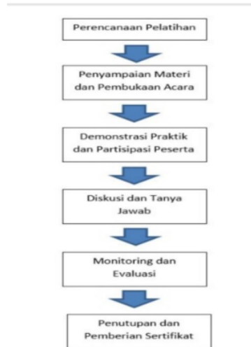
Figure 1. Diagram of POC Making Training Implementation

Diagram of POC Making Training Implementation: