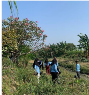
Figure 3 River Environmental Cleanup

Figure 3.2 shows the process of cleaning the river environment that causes mosquito growth Aedes aegypti . After the implementation of socialization for the surrounding community, the 18th MIT KKN students of post 112 together with the community cleaned the river near the settlement which became a breeding ground for mosquitoes due to the accumulation of non-organic waste. Previous service was also carried out by Kisanjani, (2023) who socialized about dengue prevention and mutual cooperation to clean the environment. It is also similar to the service carried out, but different in terms of application. This latest service is more specific about cleaning in a place that is very prone to becoming a mosquito nest.